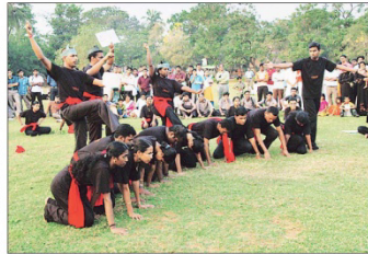
A theatre session, aimed at improving communication skills.